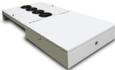
RLF-E and RLF EA Series